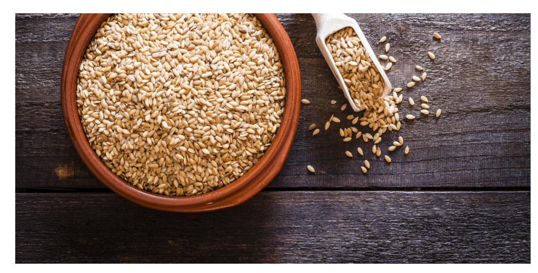
The omega-3 in flaxseed may help prevent certain types of cancer cell from developing.

Flaxseed contains some nutrients that may have various health benefits.